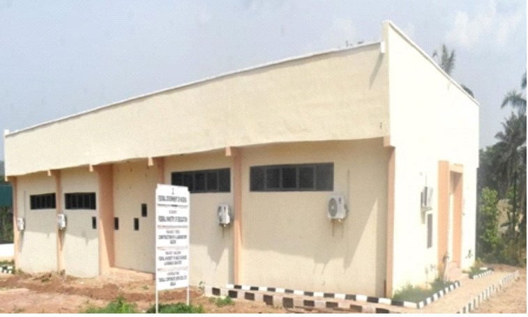
A BLOCK OF FOUR LABORATORIES