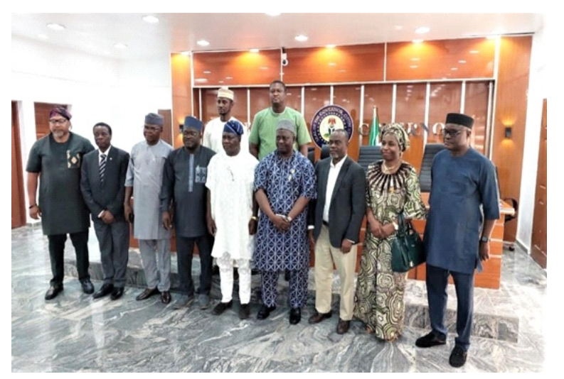
The Vice-Chancellor, the Ministry of Health Team and the Members of the Osun State Government Office.

Therefore, all necessary documents should be presented to the State Government for legislative endorsement.