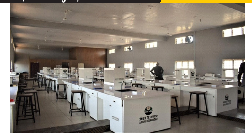
The New Biochemistry Laboratory

He affirmed that all essential equipment installed was durable and safe for the use of the students in the department.