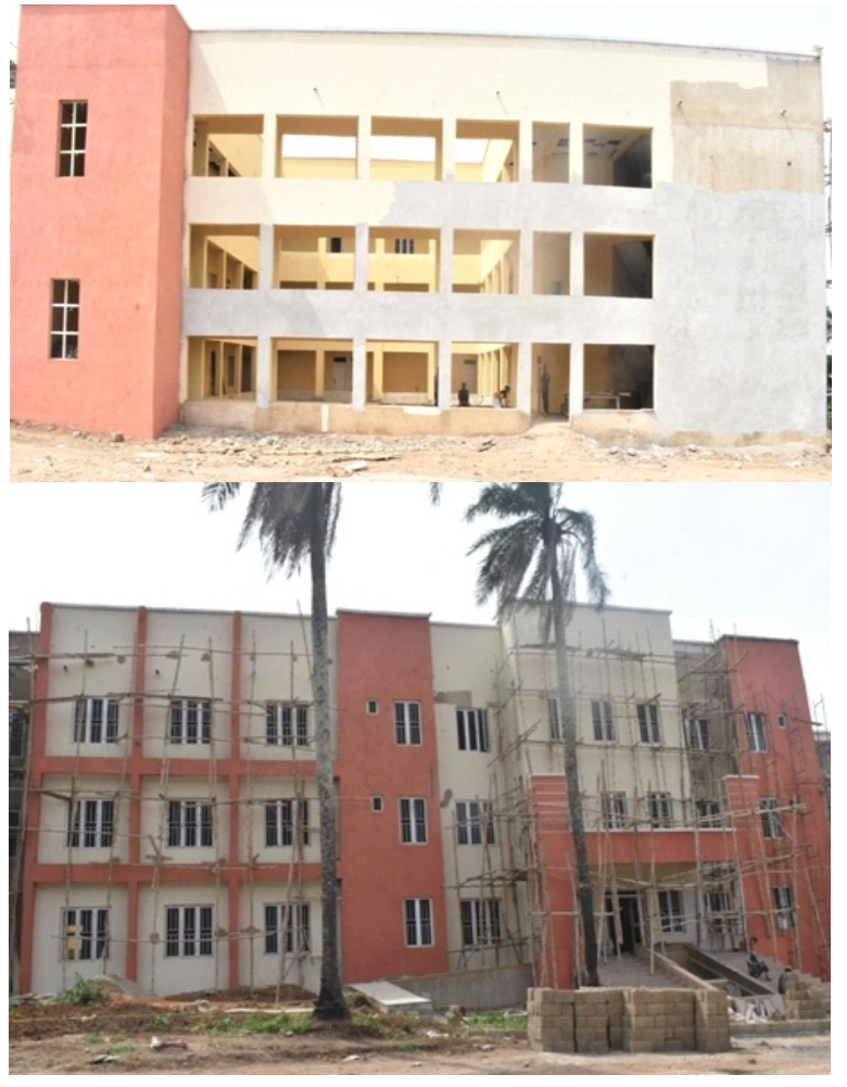
FACULTY OF BASIC MEDICAL SCIENCE BUILDING