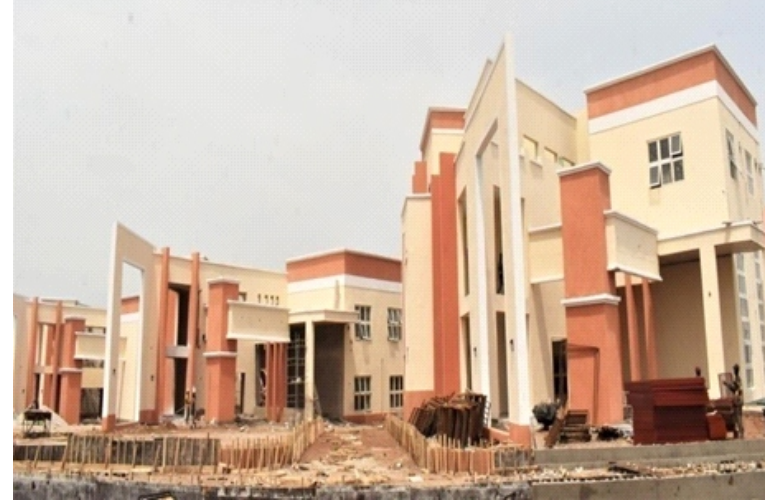
UNIVERSITY TEACHING HOSPITAL