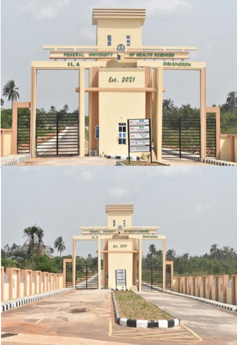
THE UNIVERSITY GATE HOUSE